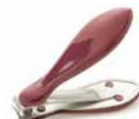
Table Top Nail Clipper

ADE230: Toenail Clippers, 4"L x 1.25" at widest point ..... $11.95